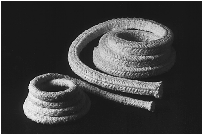
Fiberfrax Round and Square Braid