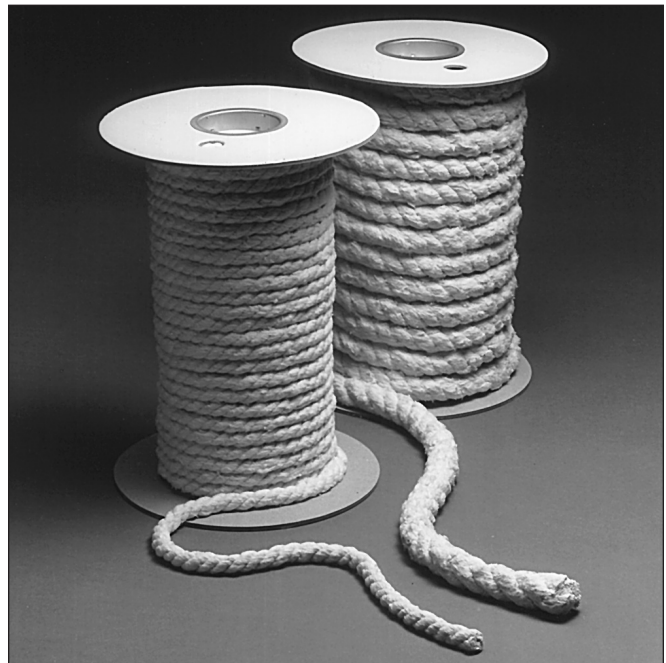
Fiberfrax Rope and HD Rope

Refer to the product Material Safety Data Sheet (MSDS) for recommended work practices and other product safety information.